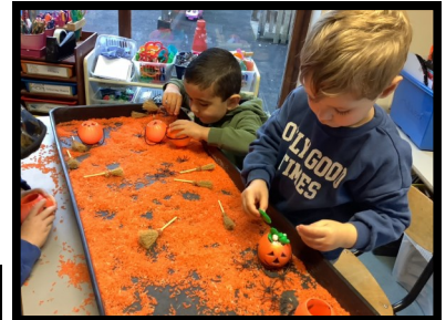
Room on the Broom Sensory tray.