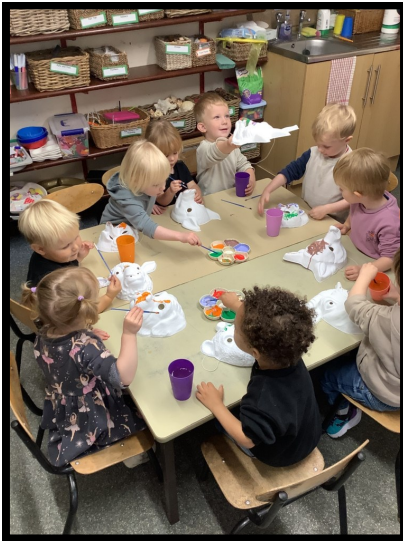
Creating our animal masks.