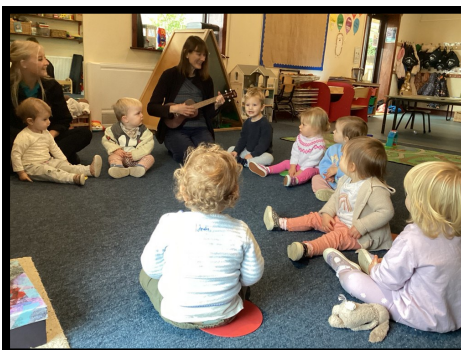
Enjoying a singing session with a ukulele.