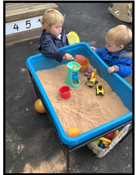
Sand tray fun.