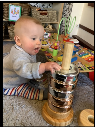
These look fun!