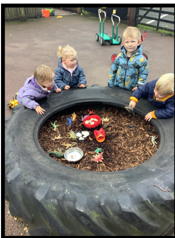
Dinosaur small world.