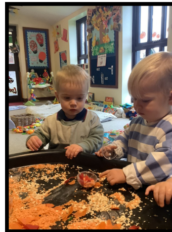
Sensory tray time.