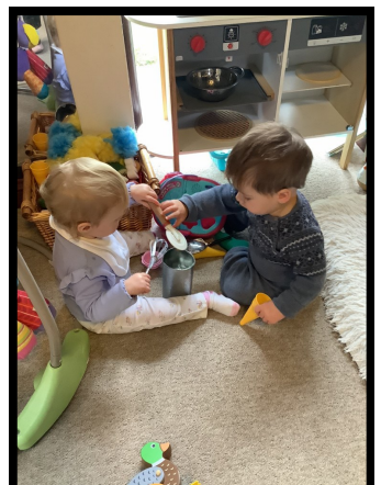
Cooking up some treats together.