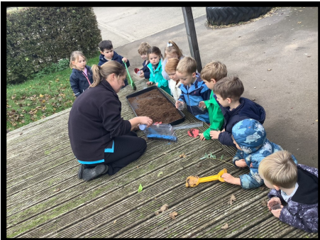
Making our Wormery.