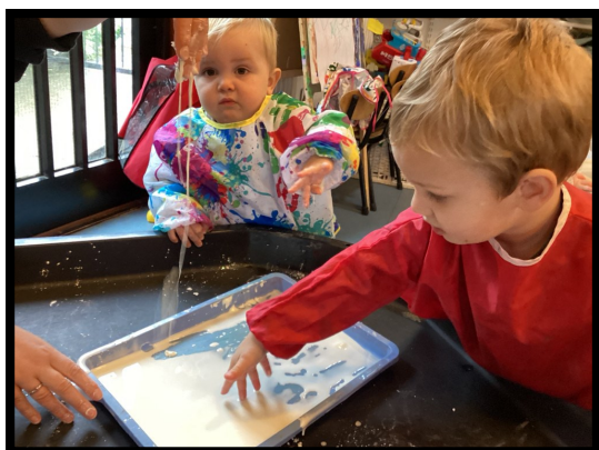
Exploring the gloop.