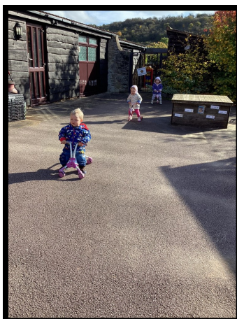
Having fun on the trikes.