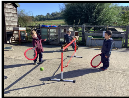
Enjoying a game of Tennis.