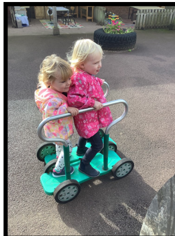
Having fun together.