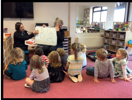
Looking at numbers.