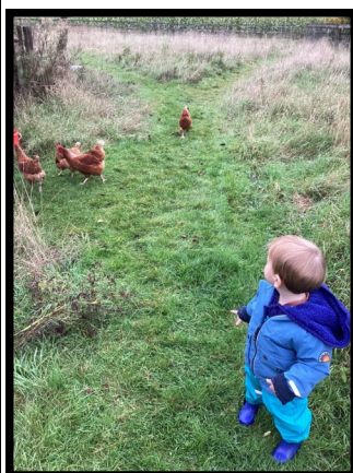
The chickens came for a walk too!