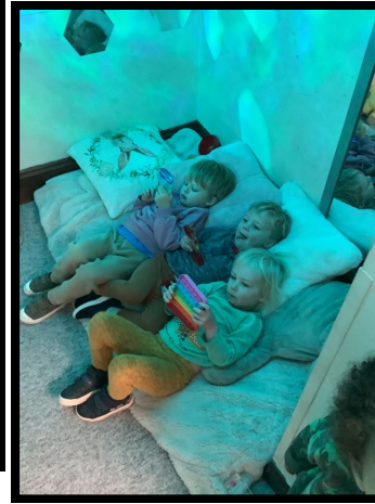
Relaxing in the sensory area.