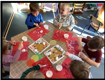
Creating our textured pictures.