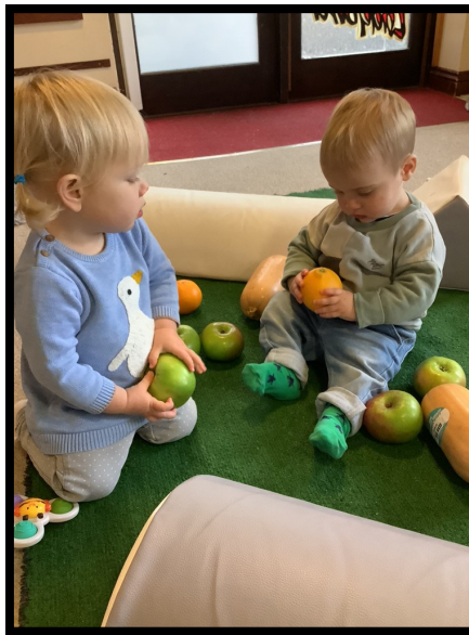
Exploring Apples and Oranges.