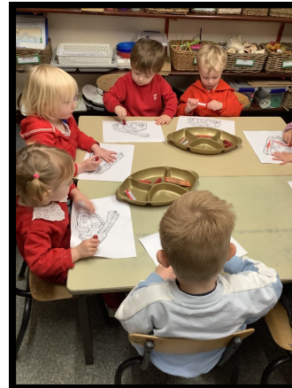
Colouring our Fire engine pictures for red day.