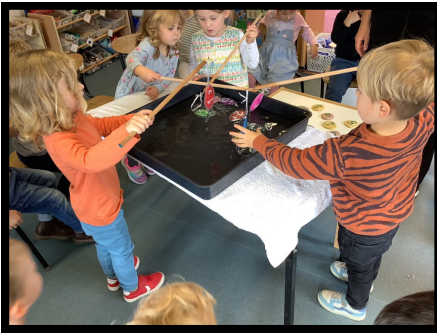
Playing the fun fishing game together.