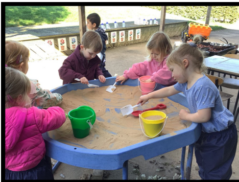
Sand tray fun.