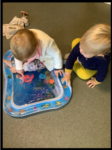
Exploring the water sensory mat.