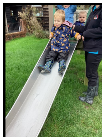
Fun on the slide.