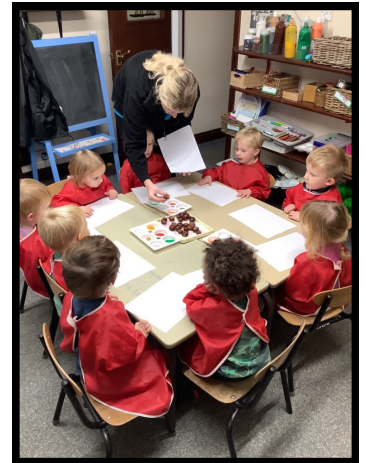
Watching how to paint with the Conkers