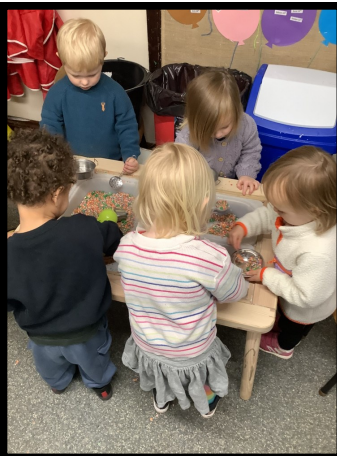
Filling and emptying .