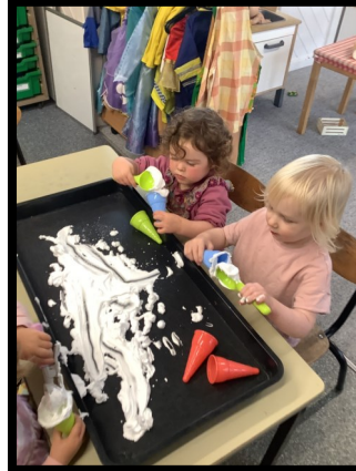
Ice cream sensory tray.