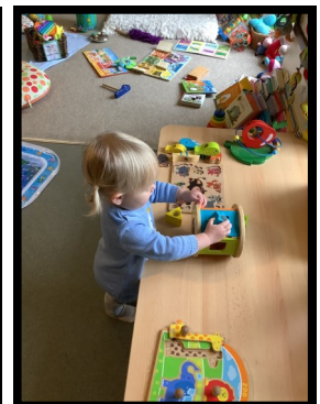
Matching up colours in the sorting set.