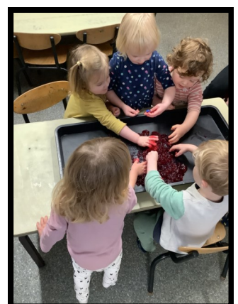
Jelly sensory tray fun.