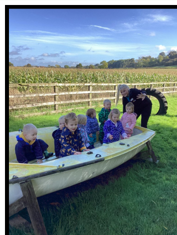
All aboard the Nursery boat.