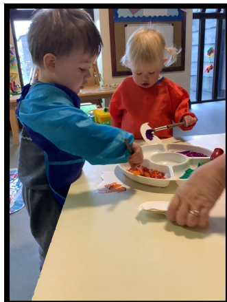
Creating our Autumn display.