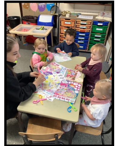
Practising our cutting.