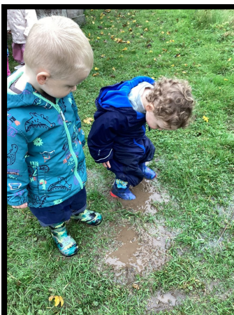
Splashing in the muddy puddles.