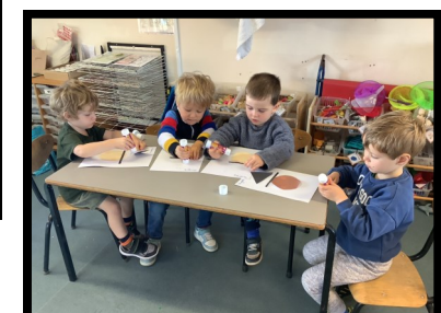
Making a sticky witch.