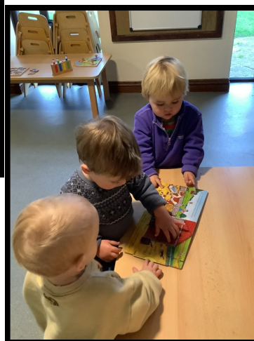
Looking at books together.