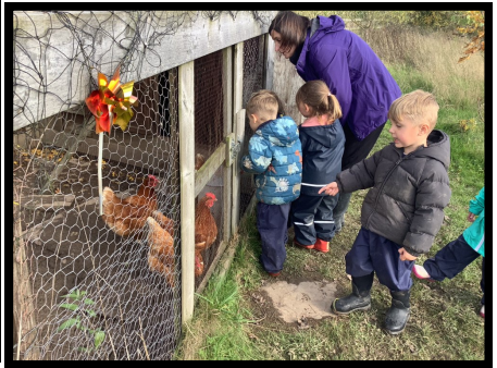
Checking the Nursery Chickens.