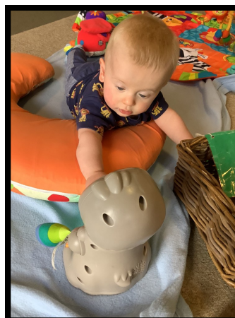
Exploring the ICT toys.