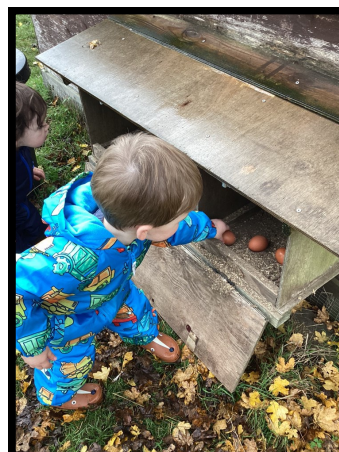
Collecting the eggs.