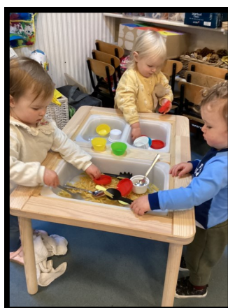
Filling and emptying pots with pasta.