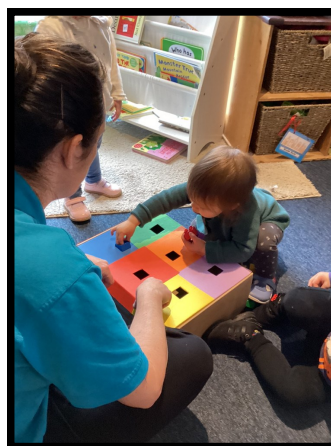
Having a go at the colour sorting game.