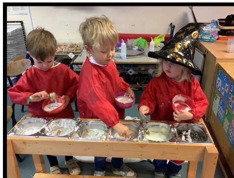
Creating magic potions .