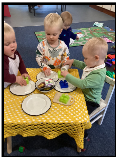
Time for tea!