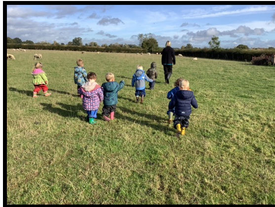
Enjoying a walk in the sheep field.